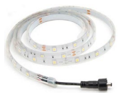
LED Canopy light (2 units max)