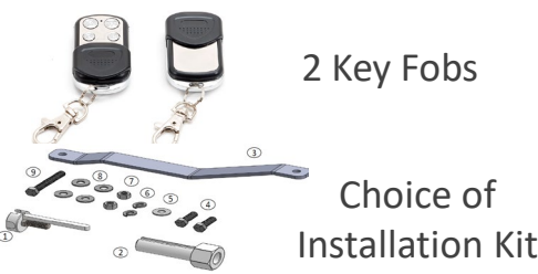
2 Key Fobs