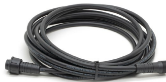
Optional pendant extension cord