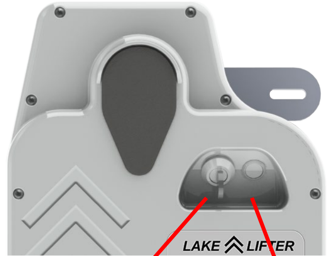
Key turn Switch

IMPORTANT: The motor should turn clockwise when lifting the boat. If the direction is opposite, then STOP immediately and reverse direction. The cable of the lift is wound on the drum backwards and must be corrected or serious damage may occur to winch, boat lift, or boat.