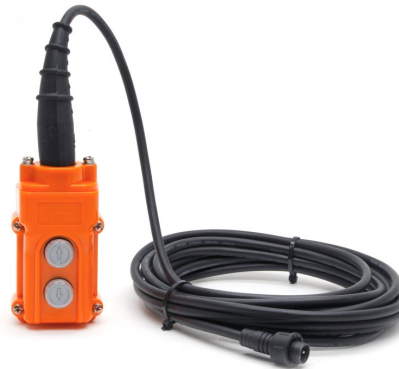
Optional pendant switch