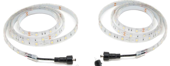
HD Y Connector