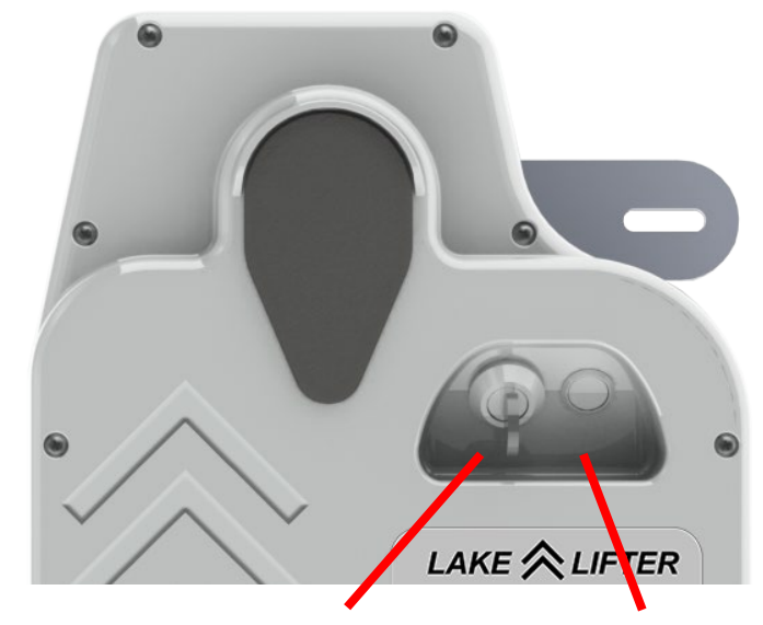
Key turn Switch

IMPORTANT: The motor should turn <u>clockwise</u> when lifting the boat. If the direction is opposite, then STOP immediately and reverse direction. The cable of the lift is wound on the drum backwards and must be corrected or serious damage may occur to winch, boat lift, or boat.